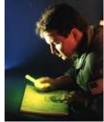
A soldier enjoys a quiet moment with a book.

Can you help? Please call the library and let us know. Our hours and phone number are at the top of this newsletter.