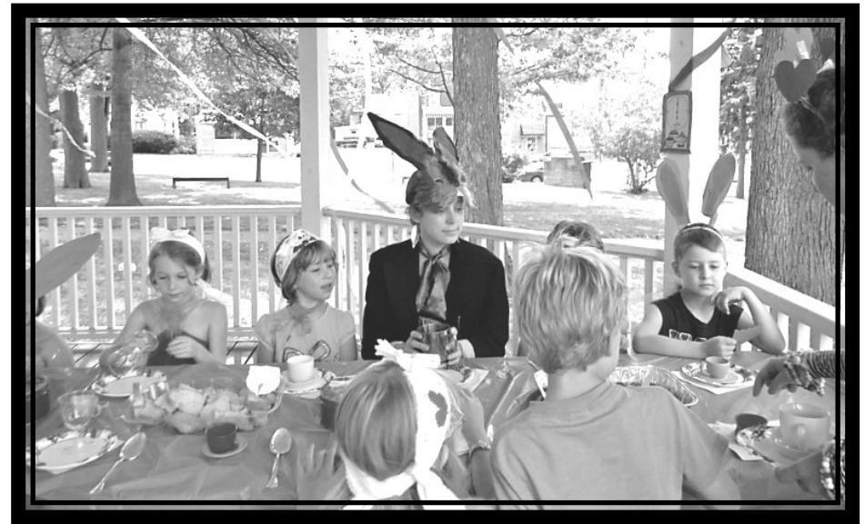
The Alice in Wonderland Tea Party, from the summer Enchanted Friday program

OPEN: Monday 9-5, Tuesday 11-8, Wednesday 11-8, Thursday 1-7, Friday 9-5, & Saturday 10-2